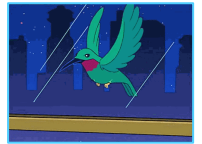
Mike was able to see a hummingbird slowly flap its wings around the 4 th espresso.

b) Using the exact value of k from part a, determine Mike's heartrate after 10 minutes. Round to the nearest whole number: