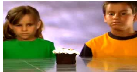
University research has shown that children actually hate small cupcakes.

c) Find the time when the cupcake will hit the ground. Round your answer to two decimal places: